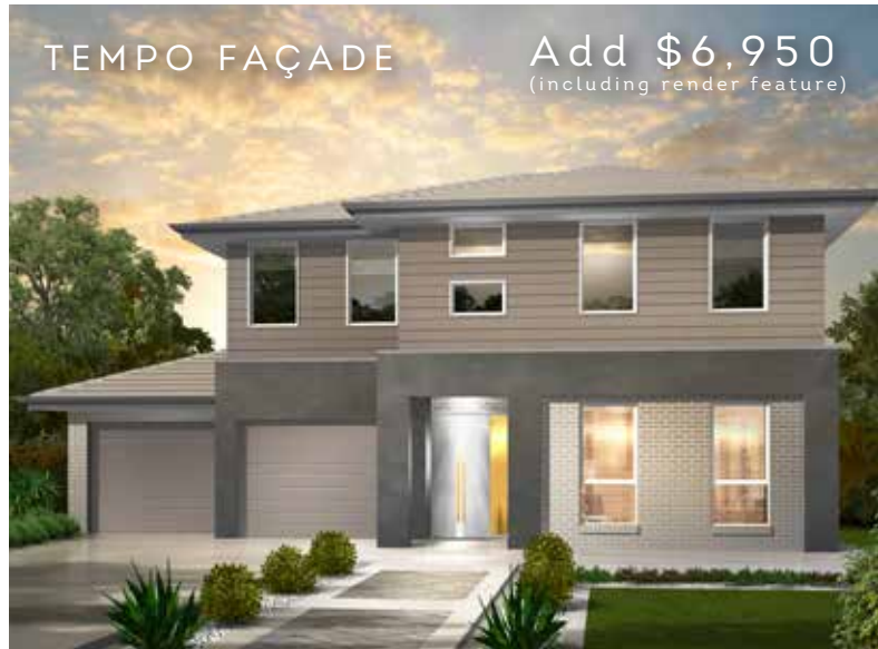
TEMPO FAÇADE Add $6,950 (including render feature)