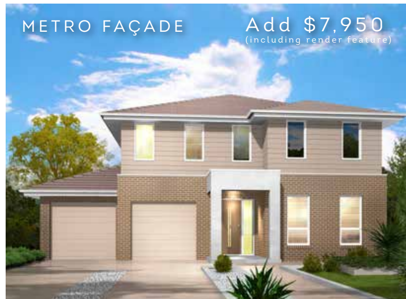
METRO FAÇADE Add $7,950 (including render feature)

VISIT ALLWORTHHOMES.COM.AU FOR MORE INFORMATION & FLOOR PLANS