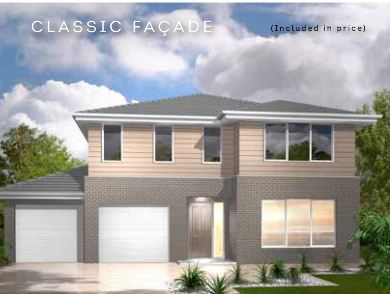
CLASSIC FAÇADE (Included in price)