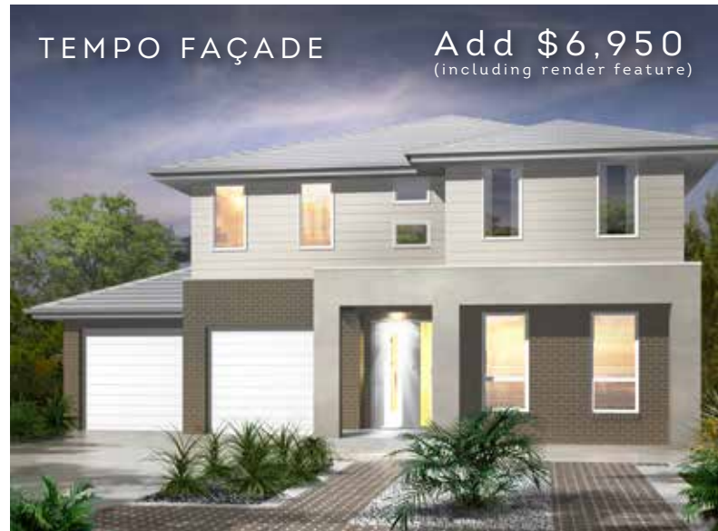
TEMPO FAÇADE Add $6,950 (including render feature)