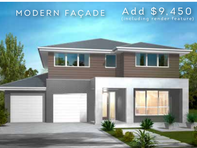
MODERN FAÇADE Add $9,450 (including render feature)