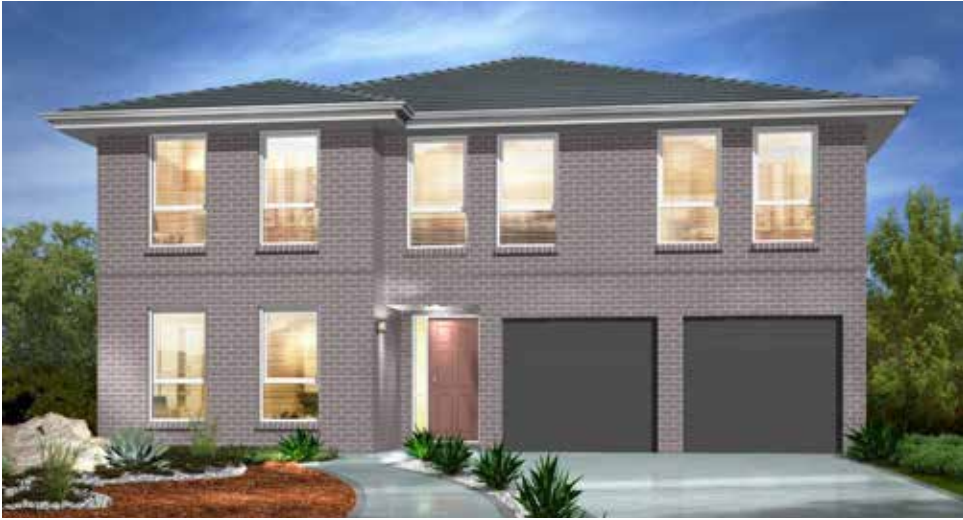
CRESCENDO CLASSIC FAÇADE