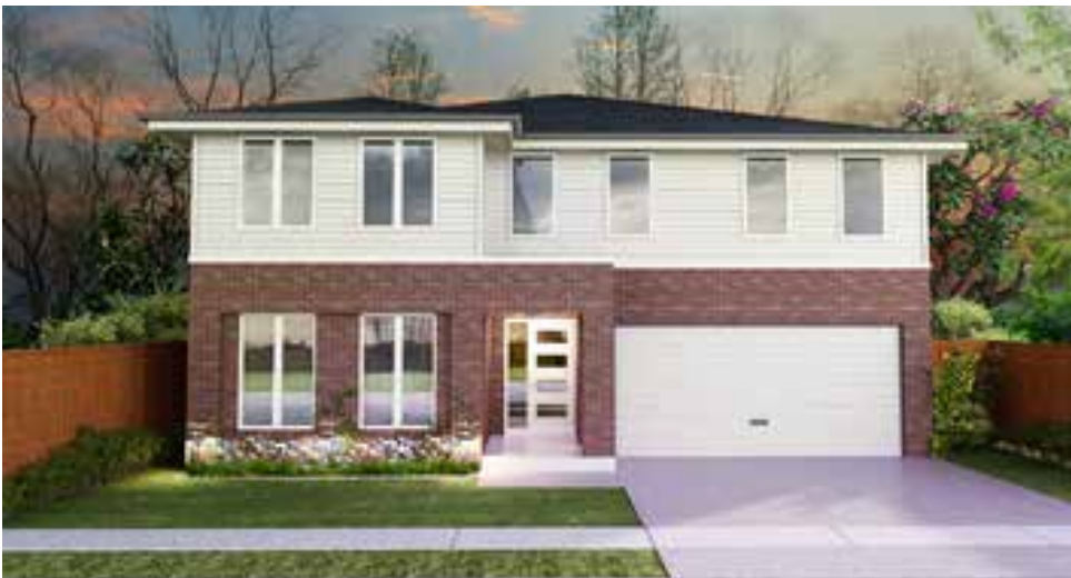
CRESCENDO METRO FAÇADE