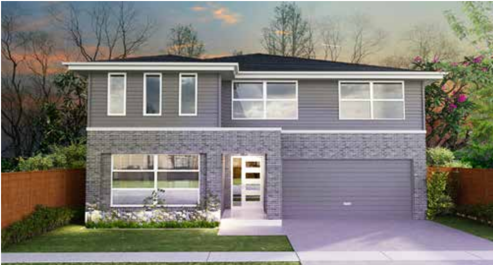
CRESCENDO TEMPO FAÇADE