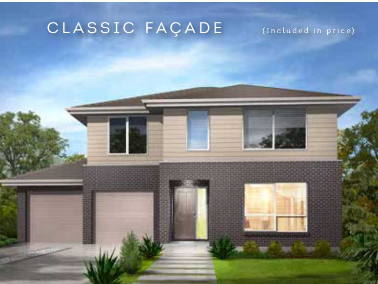
CLASSIC FAÇADE (Included in price)