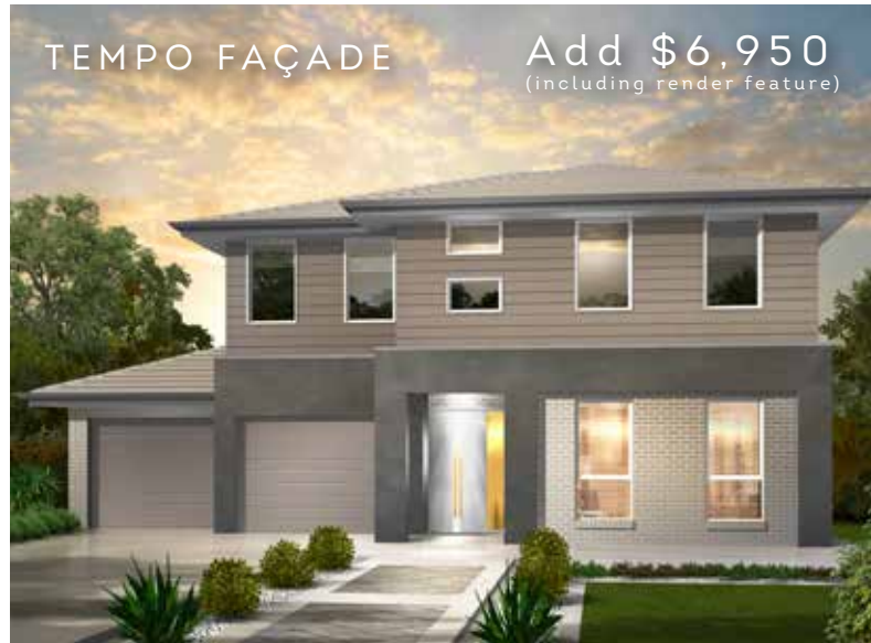
TEMPO FAÇADE Add $6,950 (including render feature)