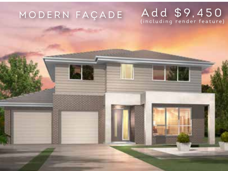
MODERN FAÇADE Add $9,450 (including render feature)