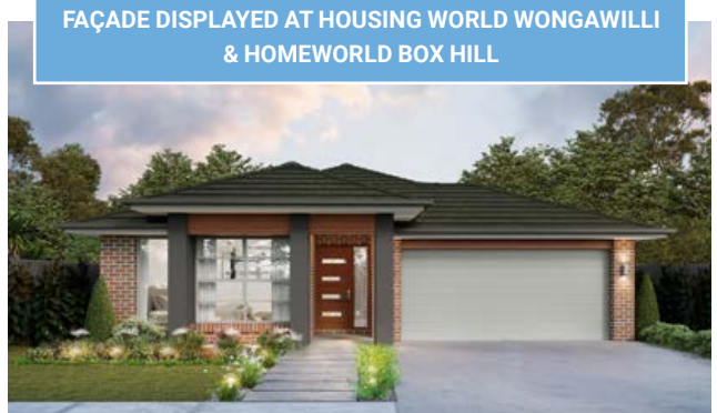
VISTA LARGO 24°

FAÇADE DISPLAYED AT HOUSING WORLD WONGAWILLI & HOMEWORLD BOX HILL