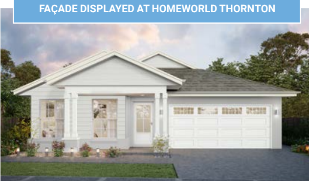
WEST HAMPTONS 24°