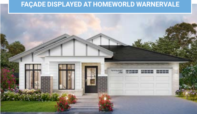
NEW HAMPTONS 24°

FAÇADE DISPLAYED AT HOMEWORLD WARNERVALE