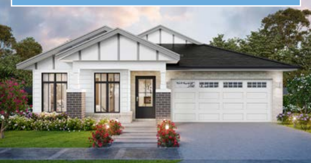
NEW HAMPTONS 24°

FAÇADE DISPLAYED AT HOMEWORLD WARNERVALE