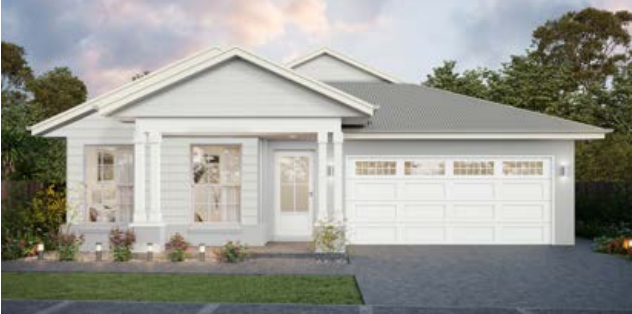
WEST HAMPTONS 24°