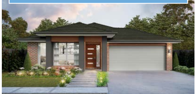
VISTA LARGO 24°