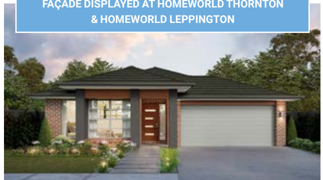
VISTA LARGO 24°

DESIGN AND FAÇADE ON DISPLAY AT THAT LOCATION