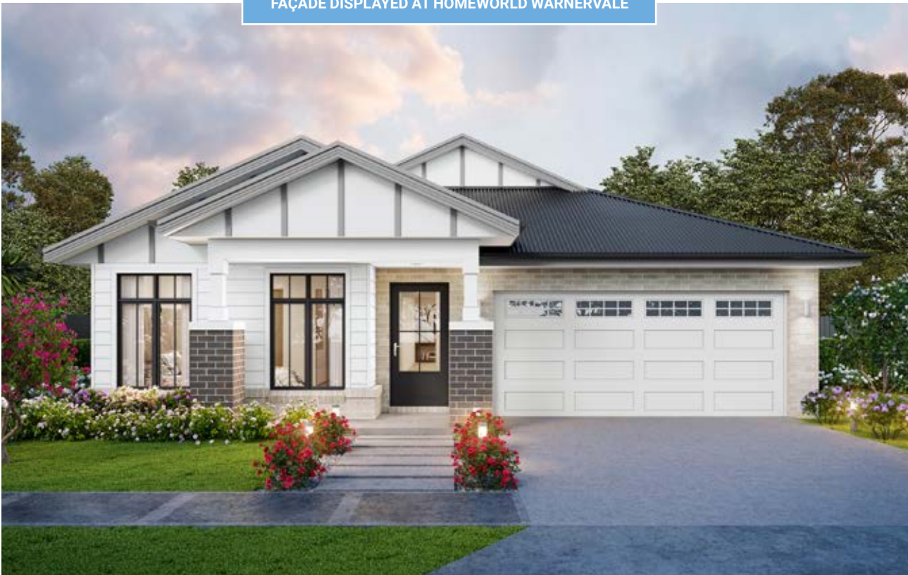
NEW HAMPTONS 24°

FAÇADE DISPLAYED AT HOMEWORLD WARNERVALE