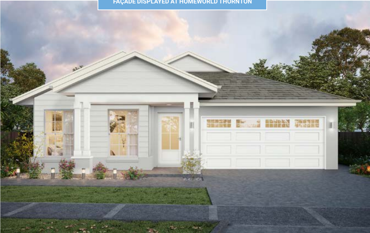
WEST HAMPTONS 24°