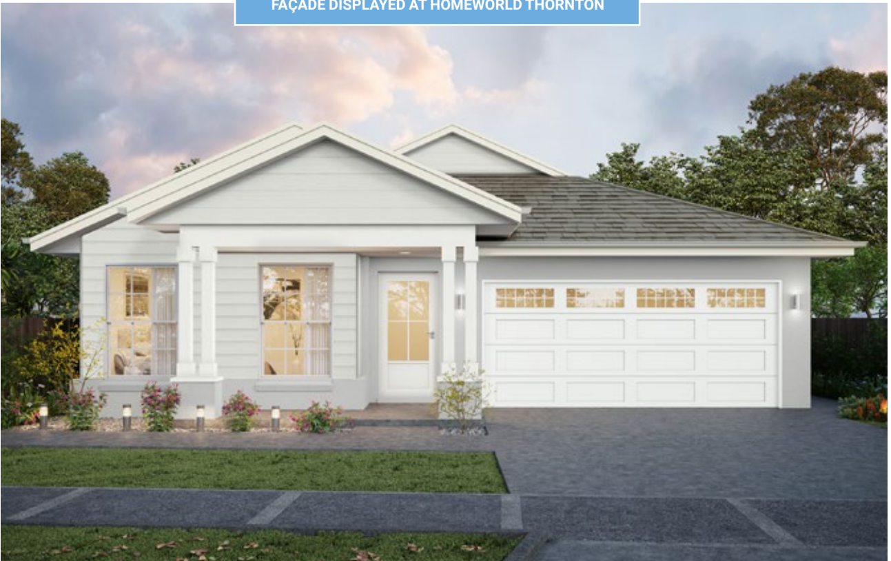
WEST HAMPTONS 24°

FAÇADE DISPLAYED AT HOMEWORLD MARSDEN PARK & HOUSING WORLD NOWRA