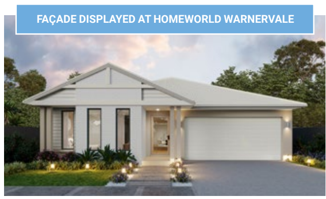
RESORT 24° TERRACE 24°