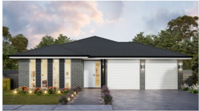
PORTICO 24° RAZA 24°