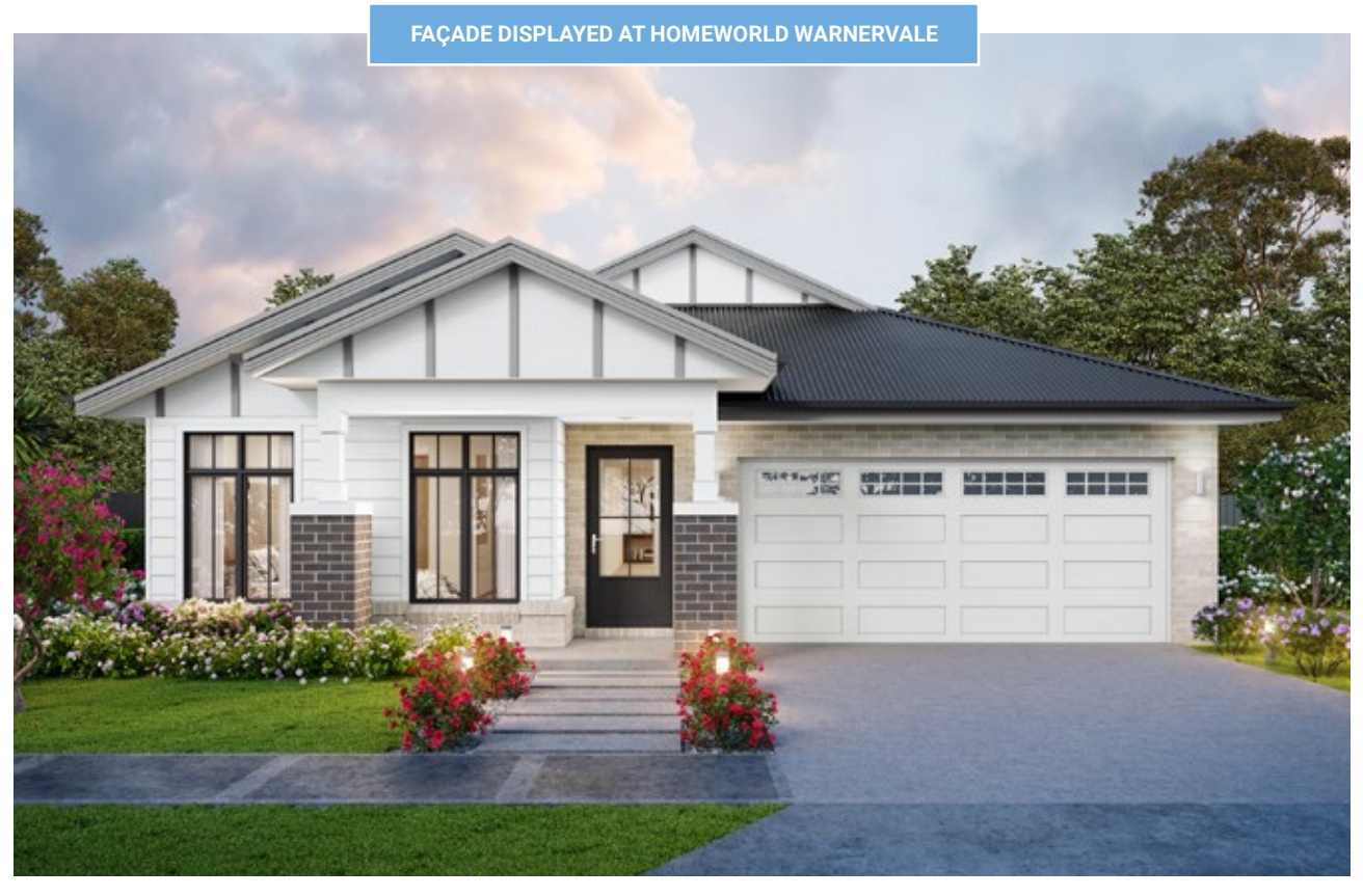
NEW HAMPTONS 24°