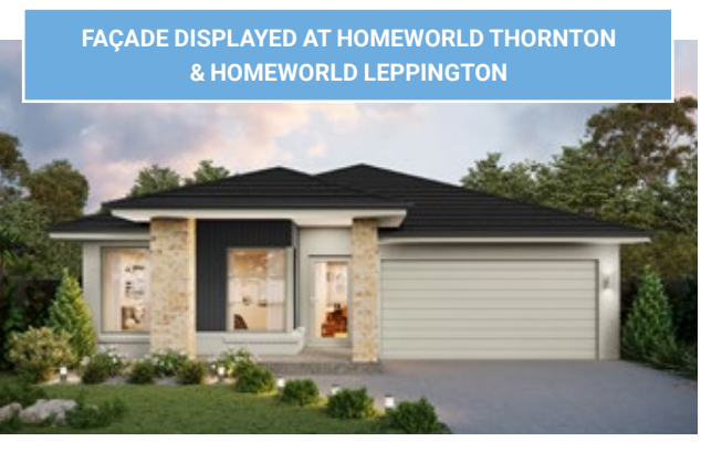
URBAN 24° VERVE 24°