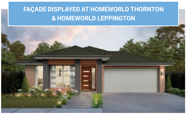
VISTA 24° VISTA LARGO 24°