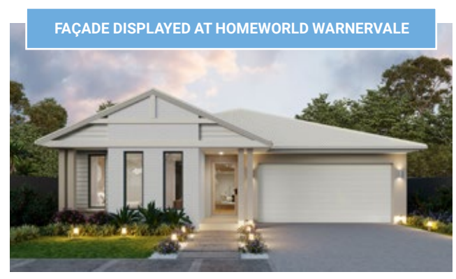
RESORT 24° TERRACE 24°