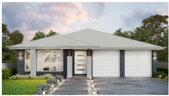
ALTO 24° BIZANTE 24°