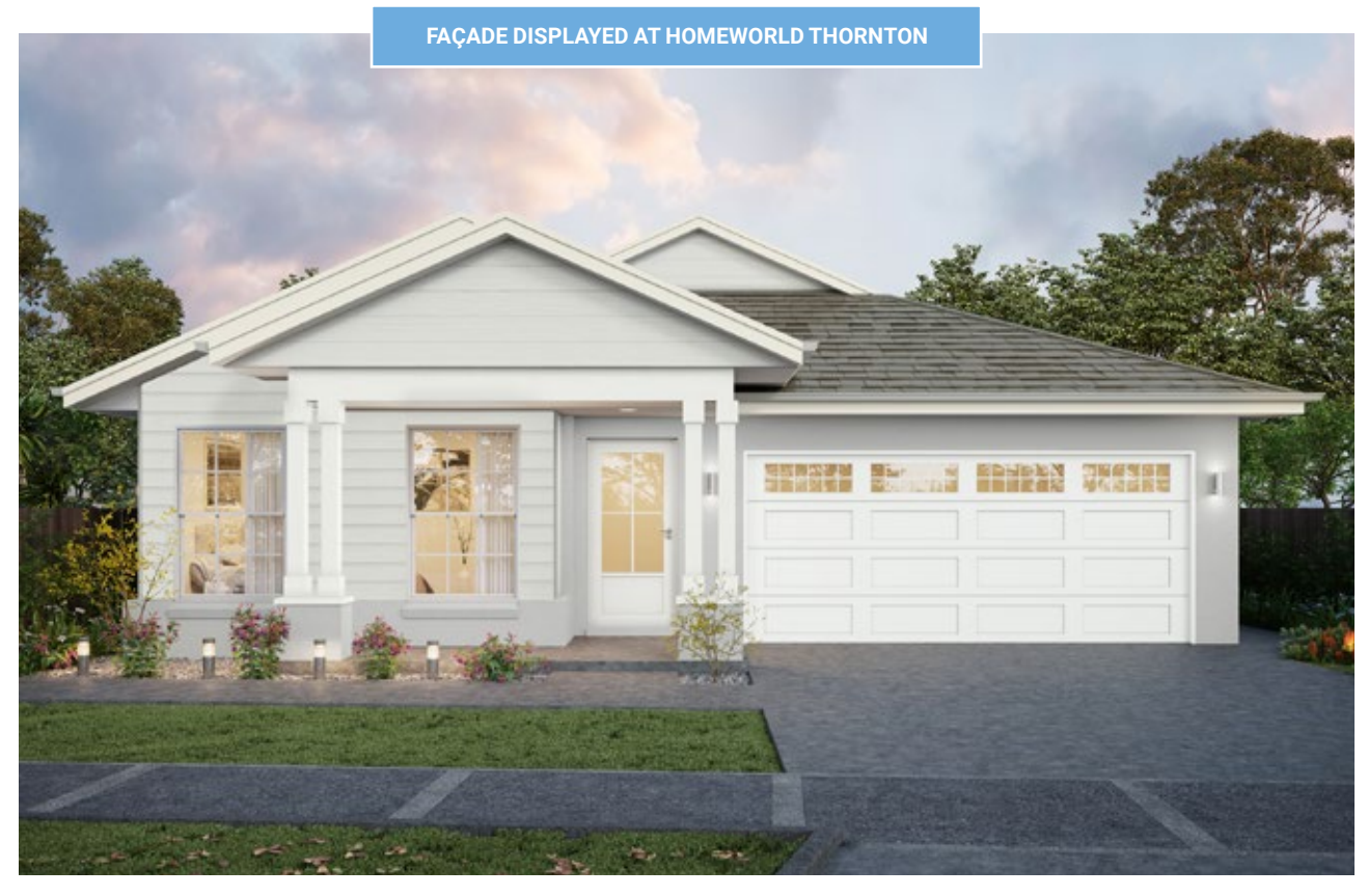
WEST HAMPTONS 24°