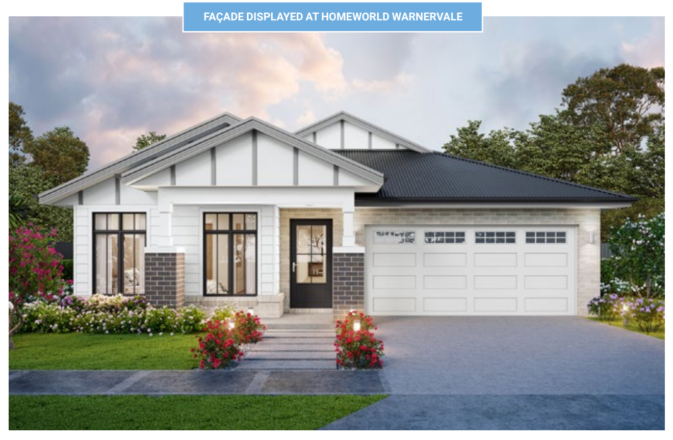
NEW HAMPTONS 24°