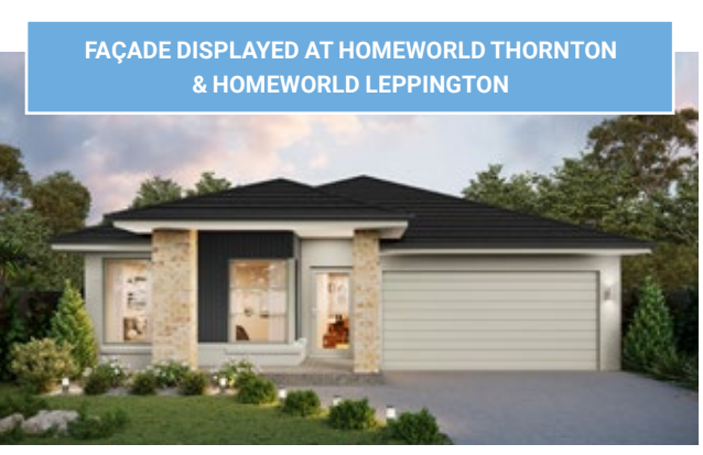
URBAN 24° VERVE 24°