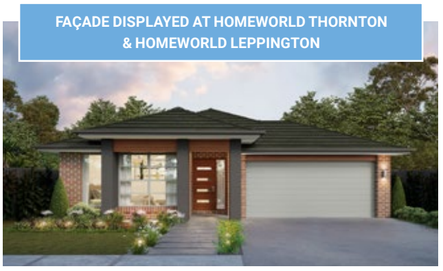
VISTA 24° VISTA LARGO 24°