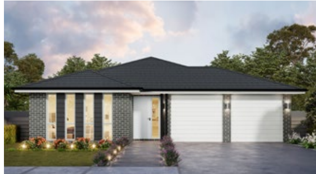
PORTICO 24° RAZA 24°