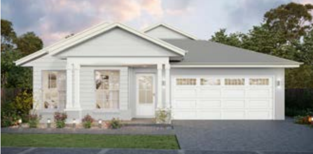
WEST HAMPTONS 24°