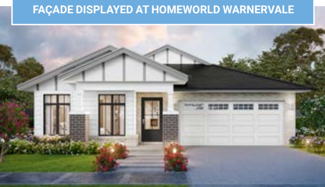
NEW HAMPTONS 24°

FAÇADE DISPLAYED AT HOMEWORLD WARNERVALE