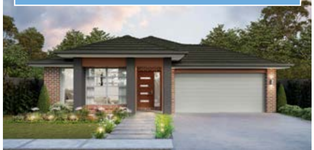
VISTA LARGO 24°